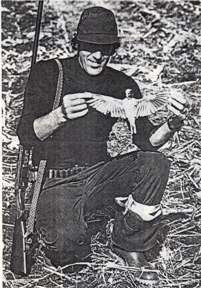
" YOUR CHEF TONIGHT "