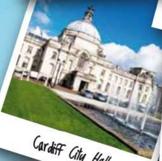
Cardiff City Hall