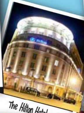
The Hilton Hotel