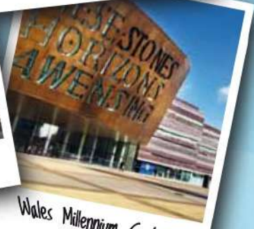
Wales Millennium Centre