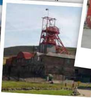
The Big Pit