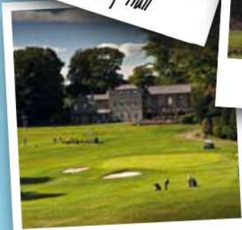
Wenvoe Castle Golf Club