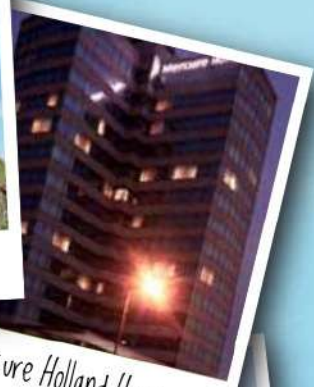
Mercure Holland House