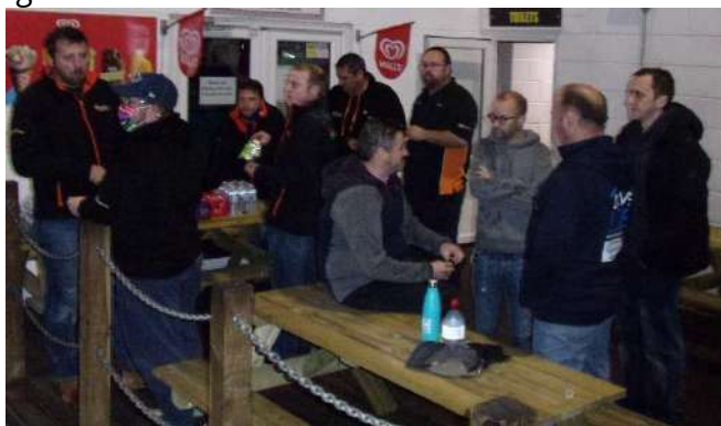
Briefing - "No Bumping" LOL ! Honiton 556 and Okehampton 944 get fuelled up