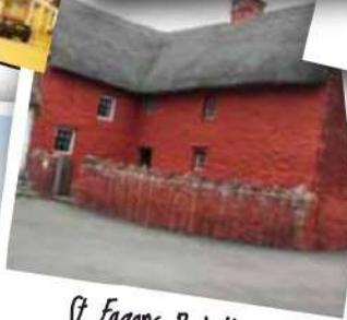
St Fagans Red House