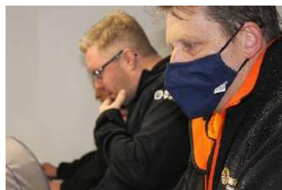
Covid-19 protocols in place Is it raining? Logging in