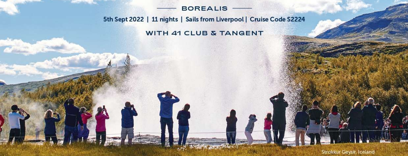
Strokkur Geysir, Iceland

You're in for an unforgettable adventure, as you go in search of the wonders and wildlife of Iceland and the Faroe Islands. From Reykjavik, journey to witness the natural power of the Gullfoss Waterfall and gushing Geysir hot springs. From Akureyri go whale watching in the northern waters to look out for humpback and minke whales, dolphins and porpoises.