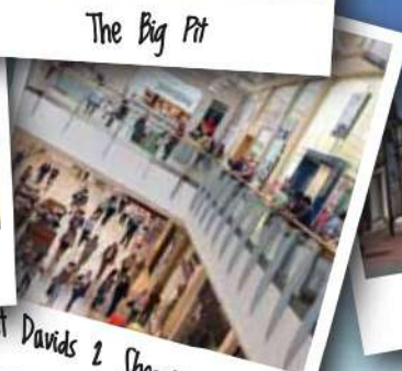
St Davids 2 Shopping Centre