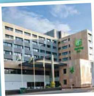
Holiday Inn - Castle Street